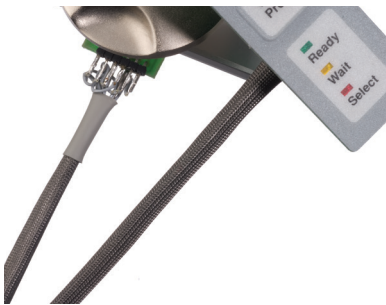
Protect component wiring leads from heat and abrasion with Insultherm® Tru-Fit® for an attractive and permanent finish.

Insultherm® Tru-Fit® provides a sturdy, long lasting, and inexpensive insulation solution. It is flexible and expandable, and can easily be installed over applications with irregular shapes and tight turns. Standard colors are Black and Natural, but other colors are available by special order. Contact your account representative for details.