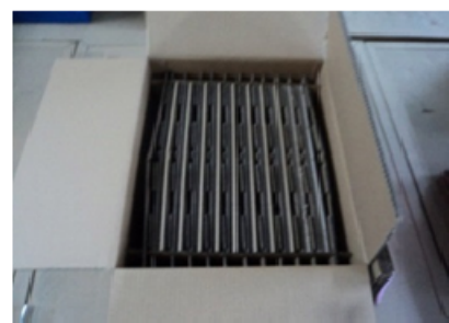
Fig. 1 : Current: 10pcs (1rowx10pcs), 11kg