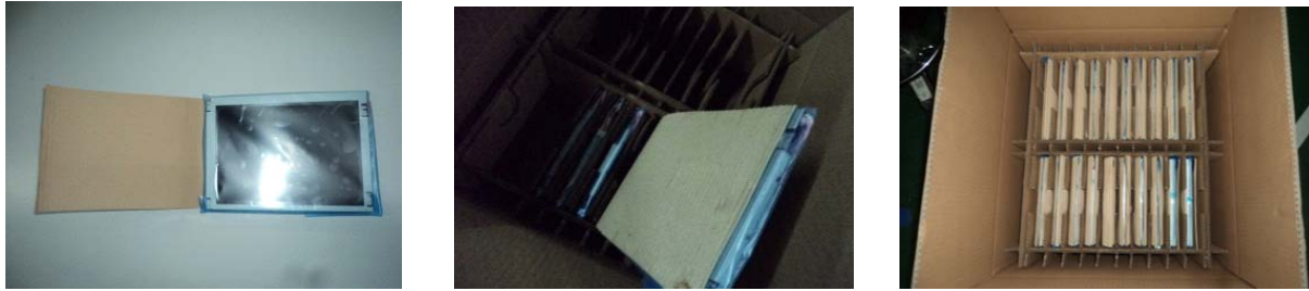
Fig. 2: New: 20pcs (two rows x 10pcs), 13.5kg

We implemented following test to verify the effect of the change.