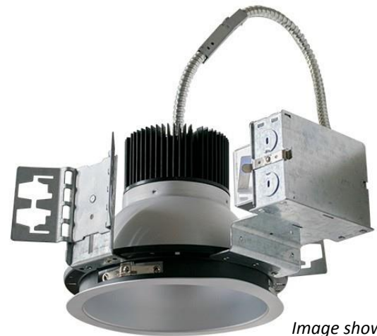
Image shown with trim & frame.