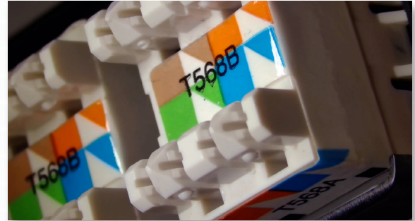
360 Viewer (View Objects at a 35 Degree Angle)