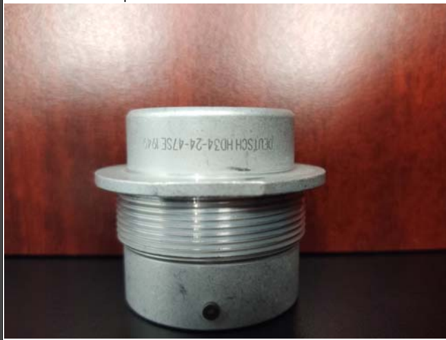
Current Size 24 Receptacle Datecode