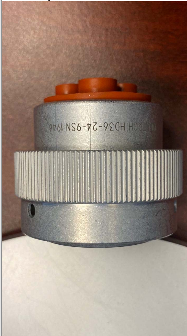
Current Size 24 Plug Datecode