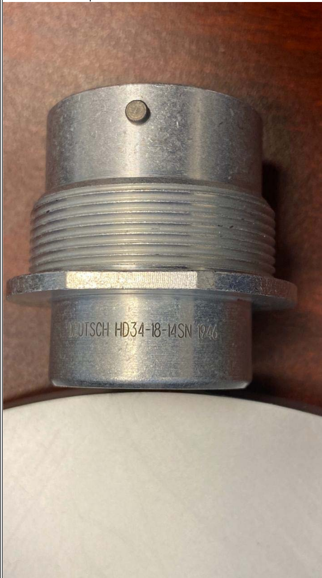
Current Size 18 Receptacle Datecode