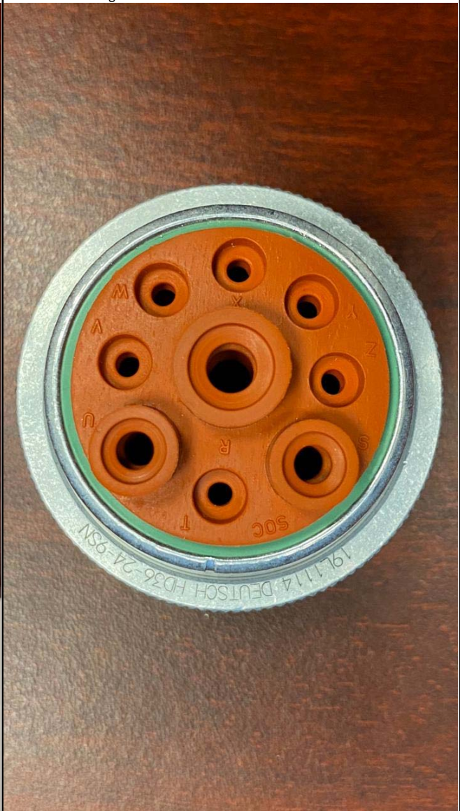
Future Size 24 Plug Datecode