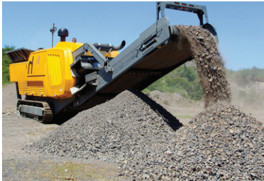
Aramid Armor® is designed to keep wires and hoses protected in the harshest situations.