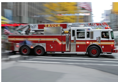
Aramid Armor® is at work every day protecting our firefighters and first responders from injury.