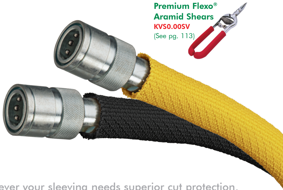
Premium Flexo® Aramid Shears KVS0.00SV (See pg. 113)

Whenever your sleeving needs superior cut protection, the cut and fire resistant properties of Aramid Armor® will fill that need.