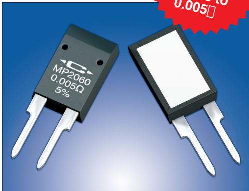
These products are covered by one or more patents, also patents pending.