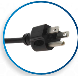
6 ft Power Cord w/ 100V Plug