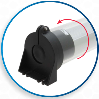
120 ° Adjustable Illumination