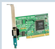
UC-246: uPCI 1xRS232