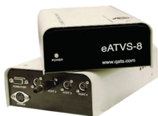
eATVS-8™ 8-Channel Automatic Temperature & Velocity Scanner