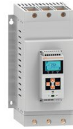
Soft starter ADXL Asynchronous three phase

Product designation Product type designation Motor type