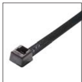
Standard Cable Ties