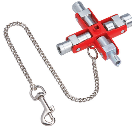
00 11 06