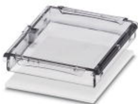
Installation component housing, Transparent hinged cover, Including insertion plate, width: 53.6 mm

Please be informed that the data shown in this PDF Document is generated from our Online Catalog. Please find the complete data in the user's documentation. Our General Terms of Use for Downloads are valid ( http://phoenixcontact.com/download )