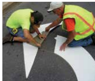
Clean, lay out and adhere

During the normal marking season, there's no need for surface preparation adhesives with Stamark pavement marking tapes. Adhesion to properly prepared pavement surfaces above 40°F is almost as easy as peel, apply and tamp.