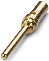
D-SUB crimp contact, connection method: Crimp connection, connection cross section: AWG 28- 26

Please be informed that the data shown in this PDF Document is generated from our Online Catalog. Please find the complete data in the user's documentation. Our General Terms of Use for Downloads are valid ( http://phoenixcontact.com/download )