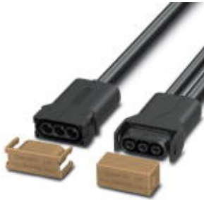
SUNCLIX micon AC Y-distributor, 3-pos., IP67, 20 A/5 A, 600 V, trunk cable: 1.15 m, drop cable: 0.5 m, incl. dust protection caps, North American version

Please be informed that the data shown in this PDF Document is generated from our Online Catalog. Please find the complete data in the user's documentation. Our General Terms of Use for Downloads are valid ( http://phoenixcontact.com/download )