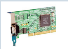
UC-235: LP uPCI 1xRS232