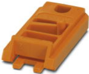
Component housing, Base latch, width: 14.4 mm, color: orange (2003)

Please be informed that the data shown in this PDF Document is generated from our Online Catalog. Please find the complete data in the user's documentation. Our General Terms of Use for Downloads are valid ( http://phoenixcontact.com/download )