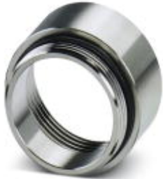
NPT adapter, IP68, up to 5 bar, incl. O-ring seal, M40 to 1 1/4"

Please be informed that the data shown in this PDF Document is generated from our Online Catalog. Please find the complete data in the user's documentation. Our General Terms of Use for Downloads are valid ( http://phoenixcontact.com/download )